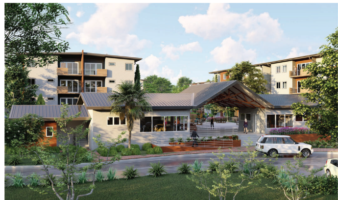
Clubhouse with a Member's Gym