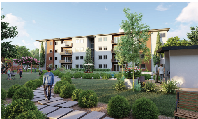
Central Green Space with Pedestrian Pathways