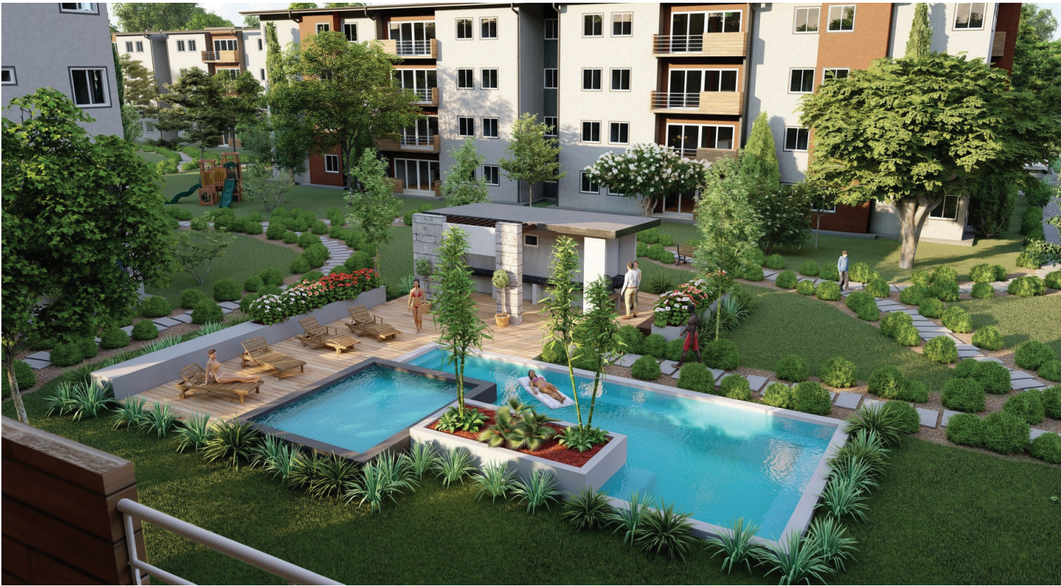
Central Green Space with Gazebo and Pool Area